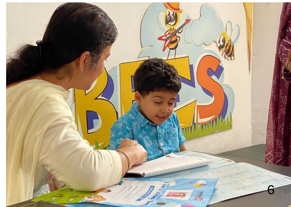
As the Nursing Faculty understand the health of the toddlers