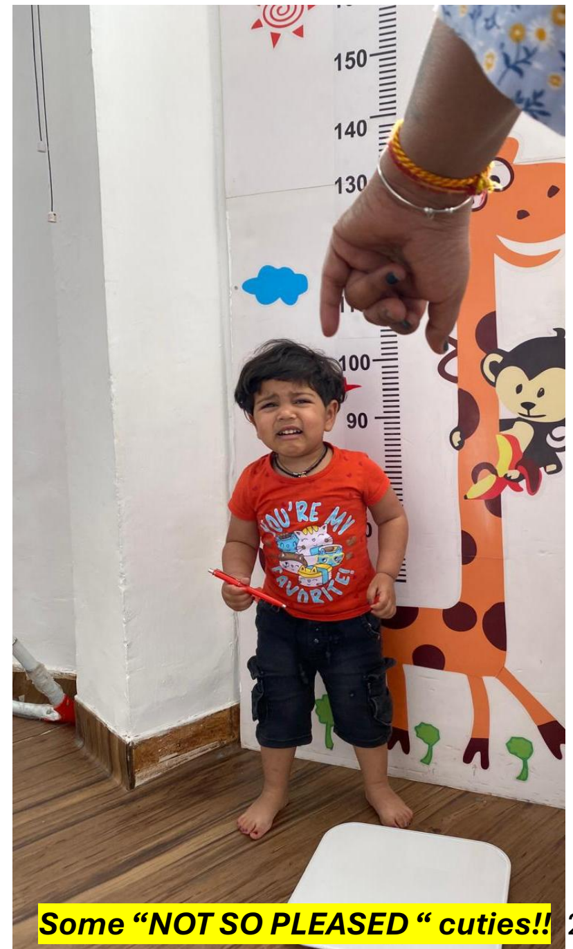
Some "NOT SO PLEASED" cuties!!