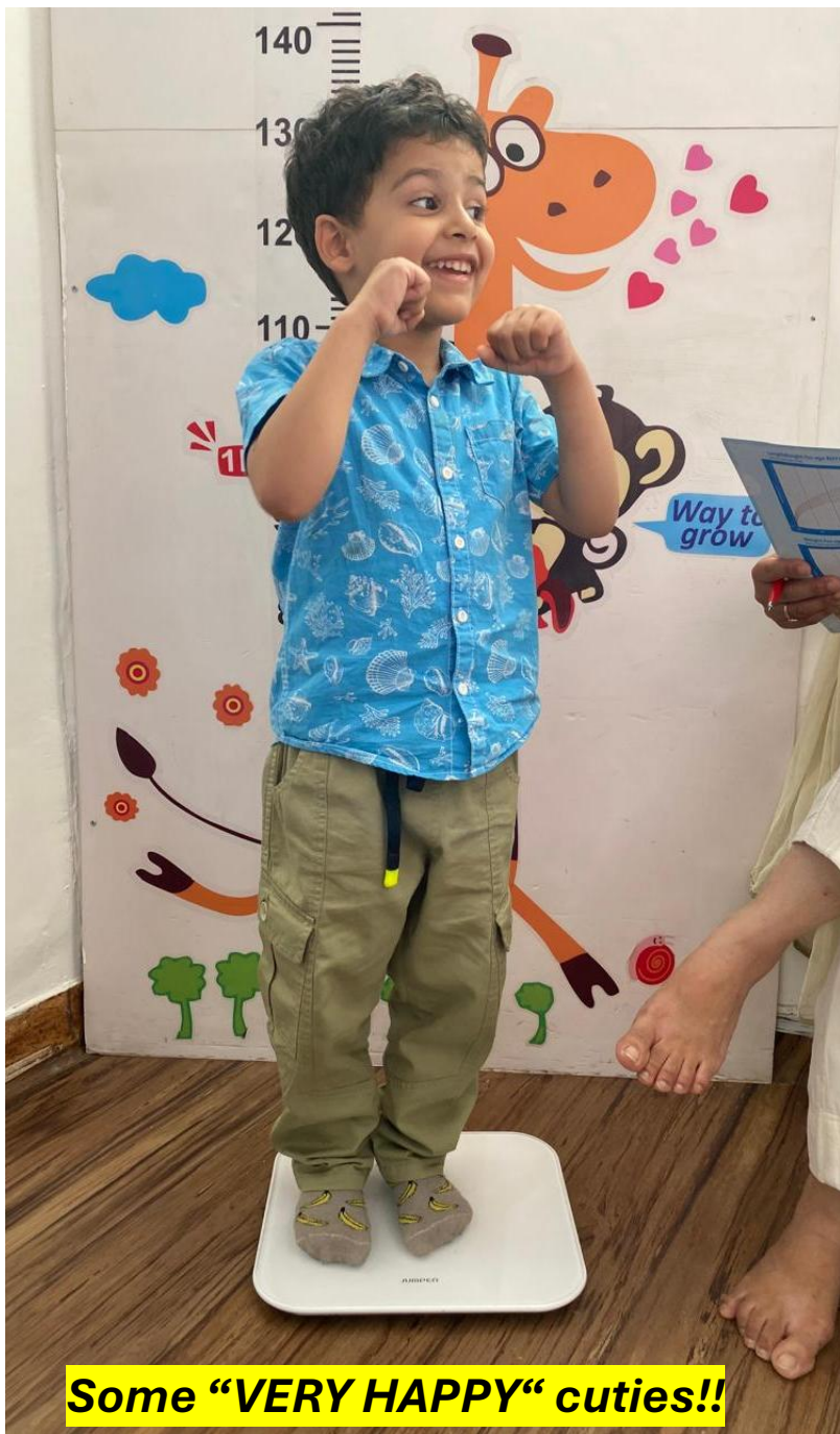
Some "VERY HAPPY" cuties!!