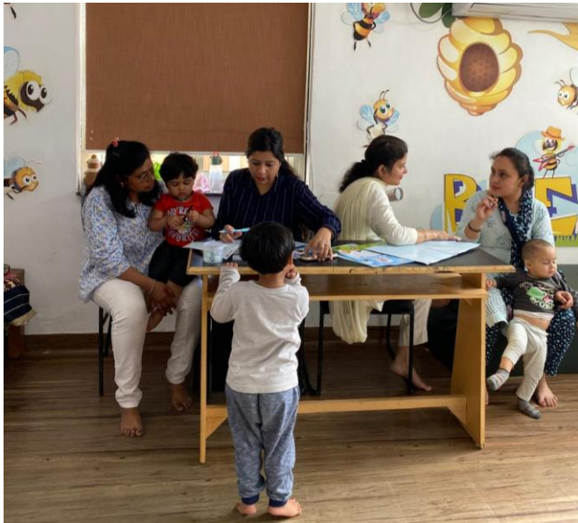
Parents of toddlers interacting with the Nursing Faculty