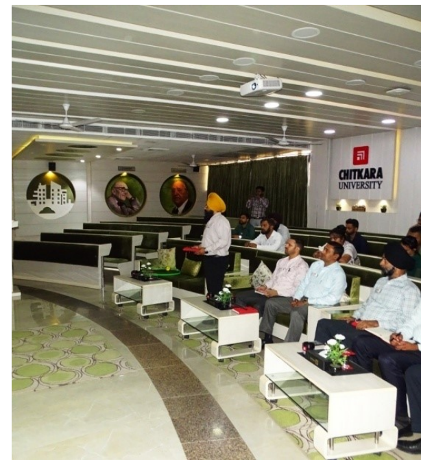
As the participants introduced themselves....