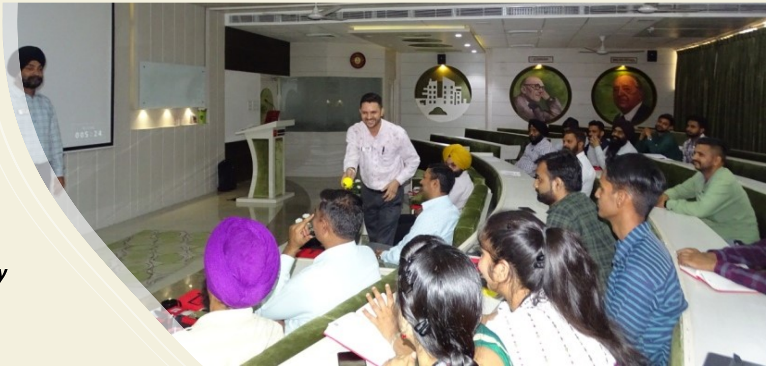
Smiling Ball Activity