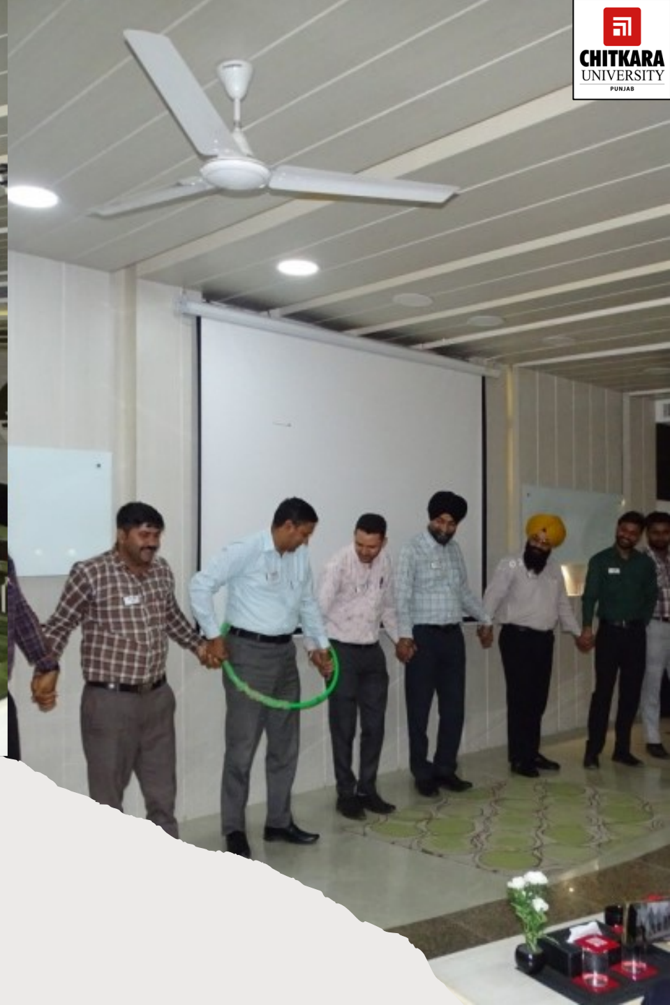
Hula hoop Activity