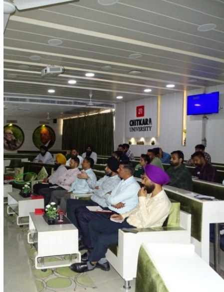
Being made aware of simple phrases in English speaking...