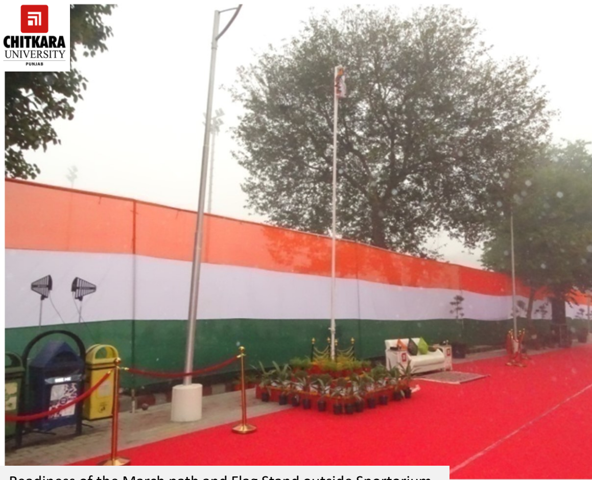
Readiness of the March path and Flag Stand outside Sportorium