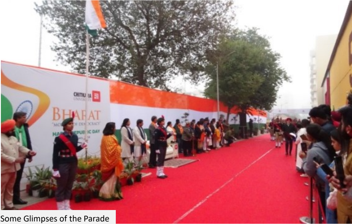
Some Glimpses of the Parade