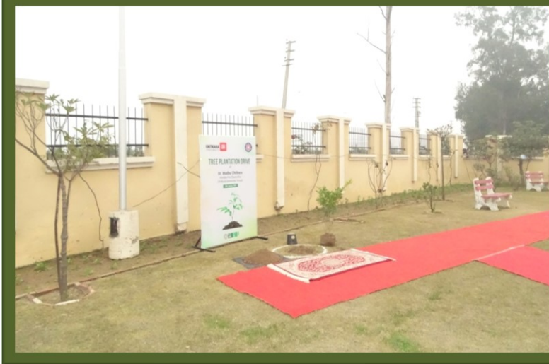
Photos during Plantation drive