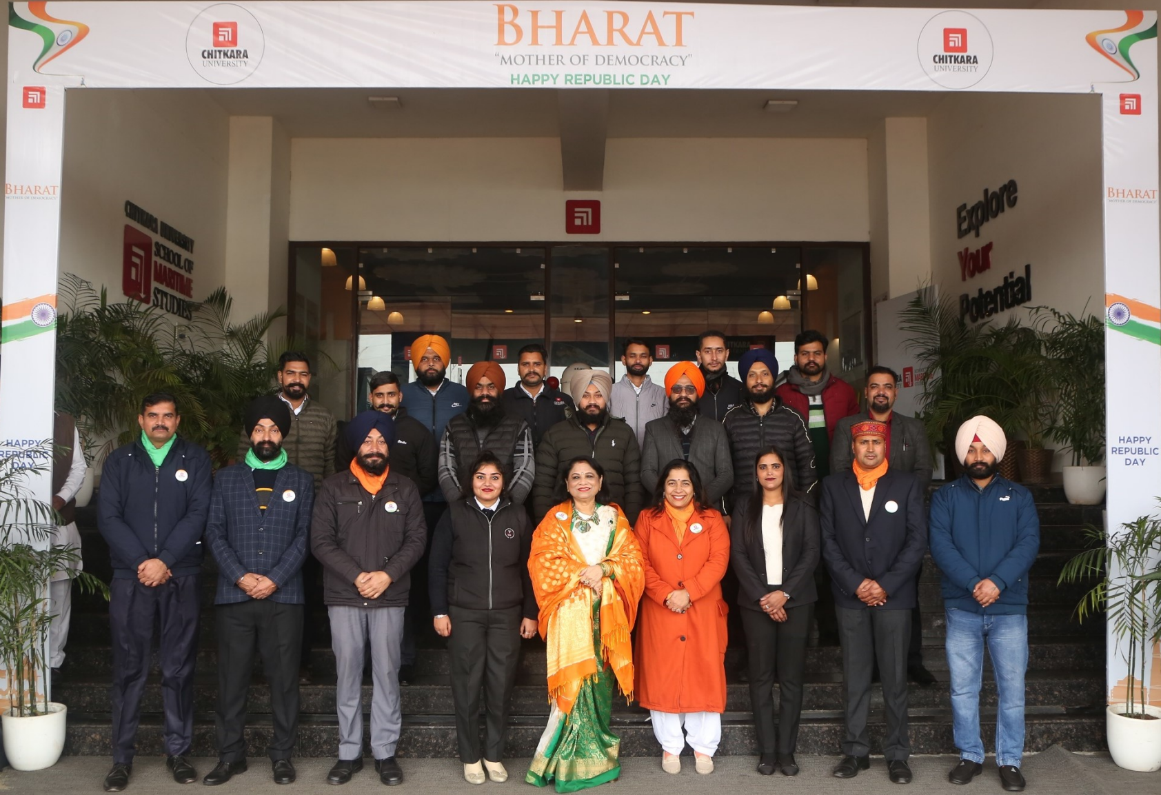
TEAM ADMINISTRATION WITH HON'BLE PRO CHANCELLOR