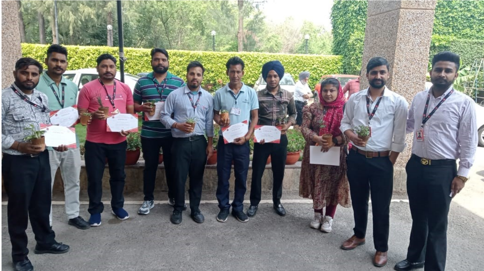
The proud blood donors with their Certificates.