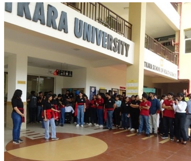
As the guests from Young Indians Chandigarh Chapter watch the “ josheela’ nukkad naatak ”