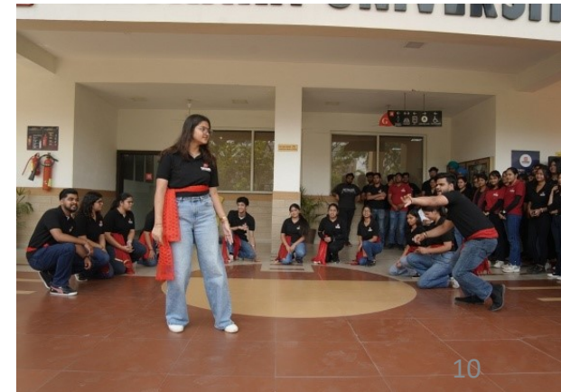
Glimpses of the nukkad naatak