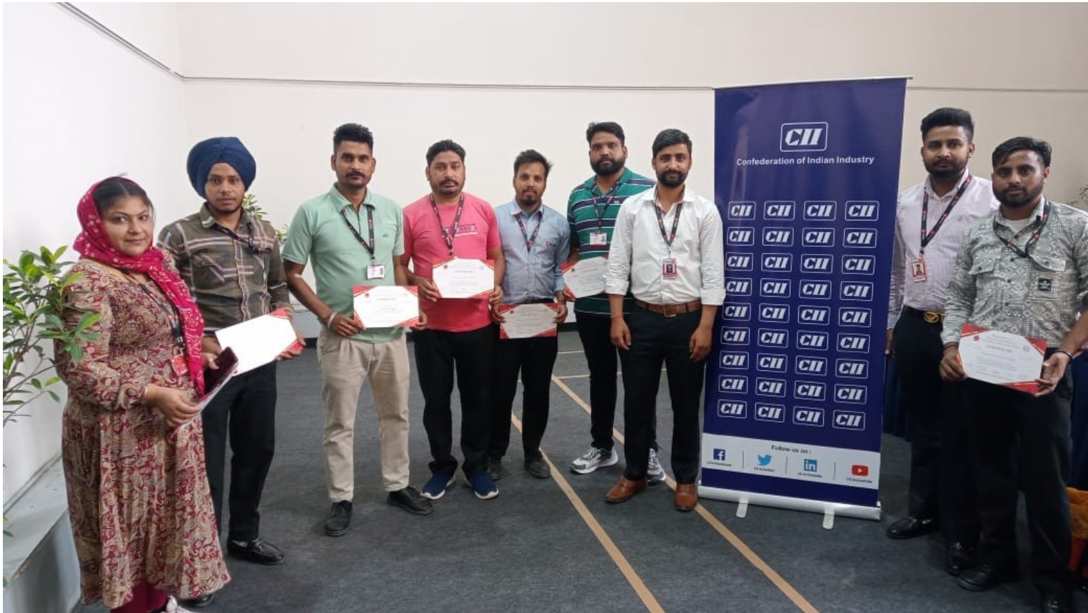
The proud blood donors with their Certificates.