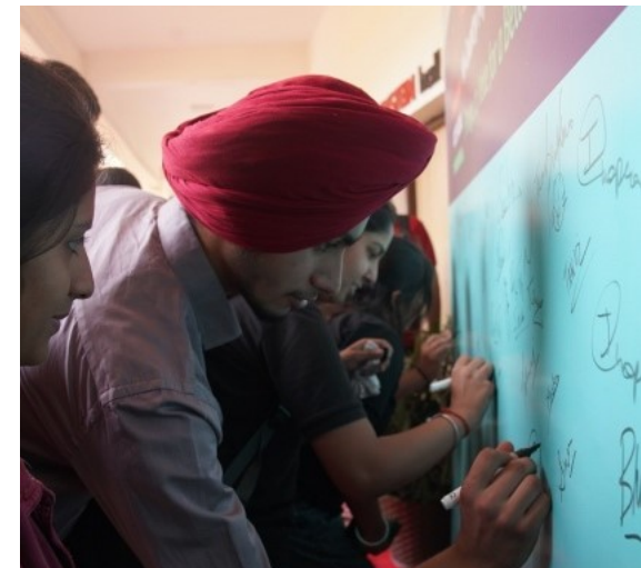
As students signed a pledge to cast their vote