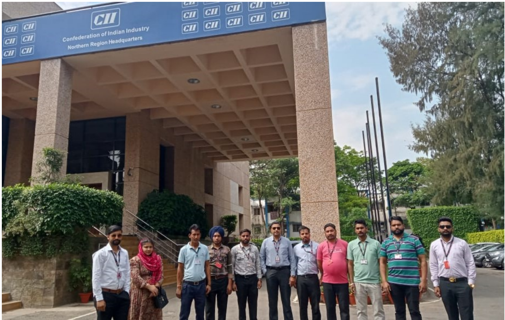
Office of Administration routed 10 staff for the blood donation camp organized by Young Indians Chandigarh Chapter