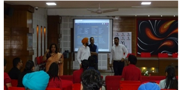
The session in progress....