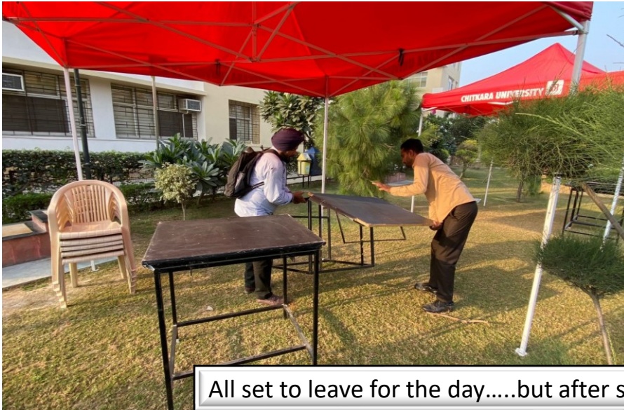
All set to leave for the day....but after shifting of the furniture, paintings etc. to indoors