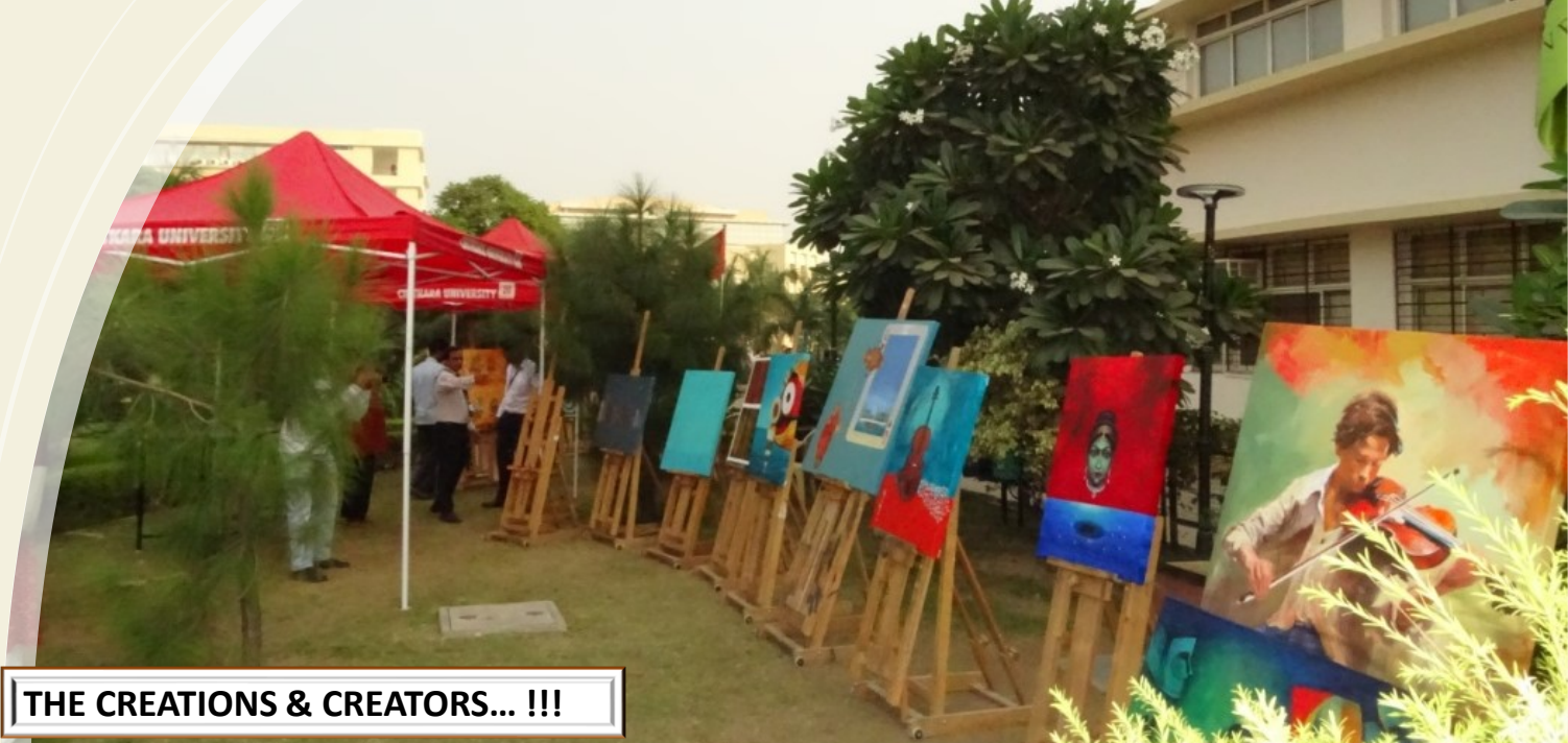
THE CREATIONS & CREATORS... !!!