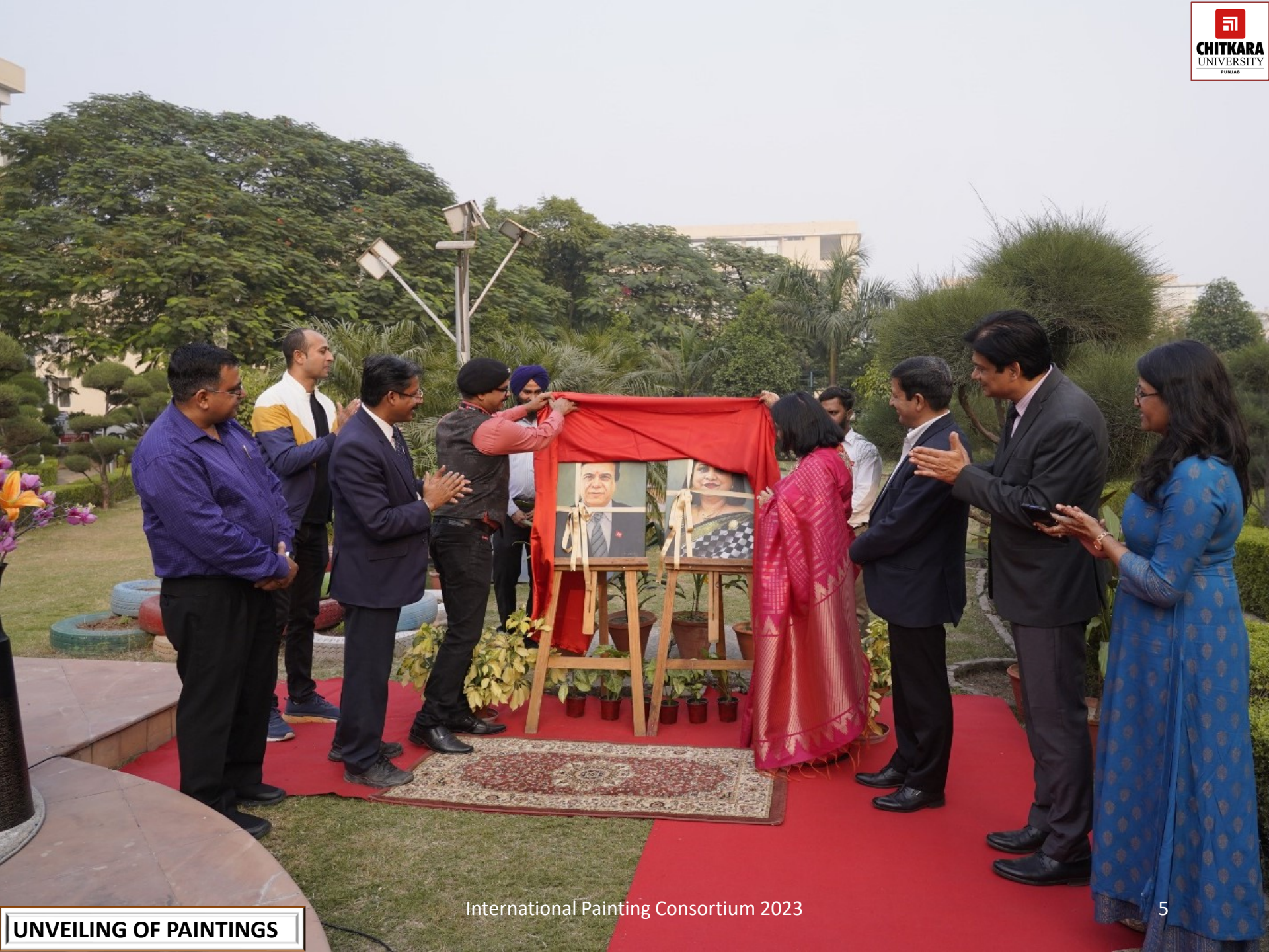
International Painting Consortium 2023