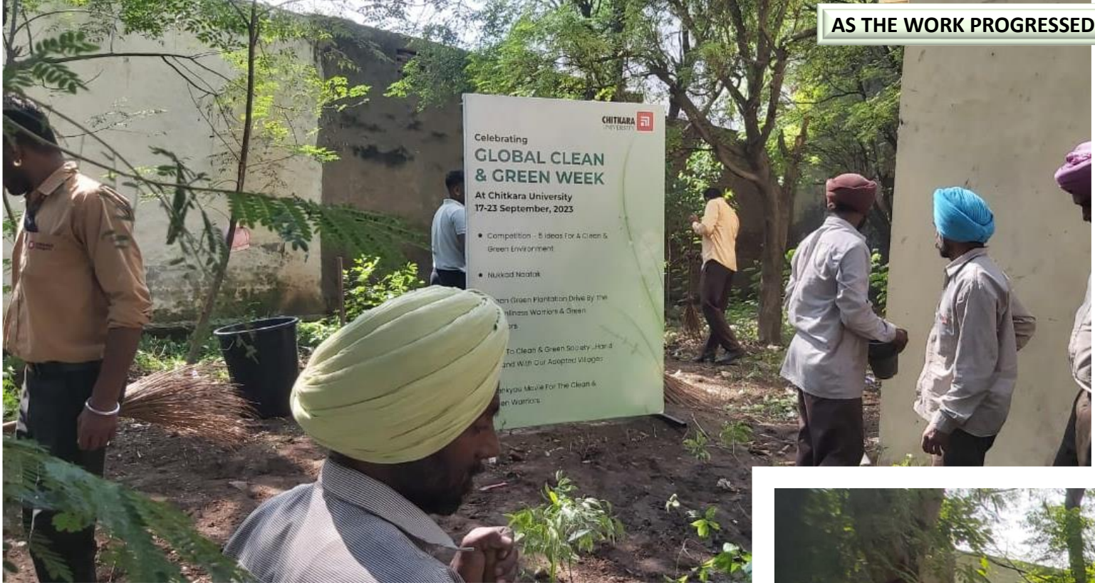
Area cleared and a Garden created