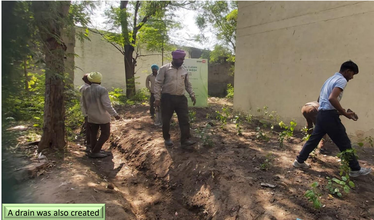
A drain was also created