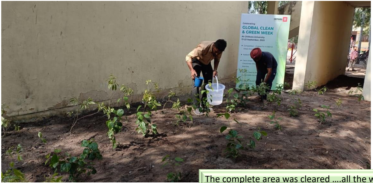
The complete area was cleared ....all the waste and unwanted greenery was cleared