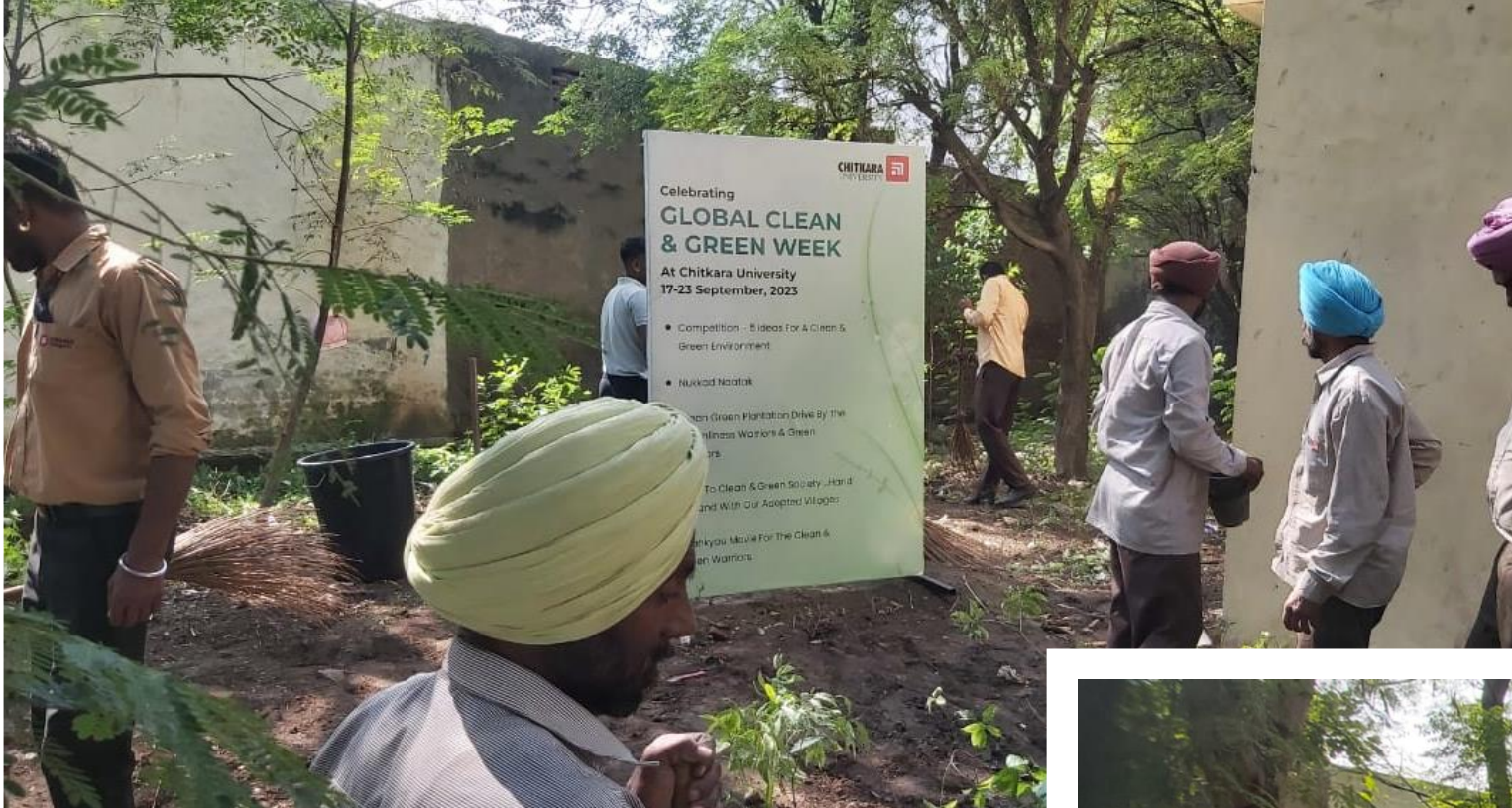
Area cleared and a Garden created