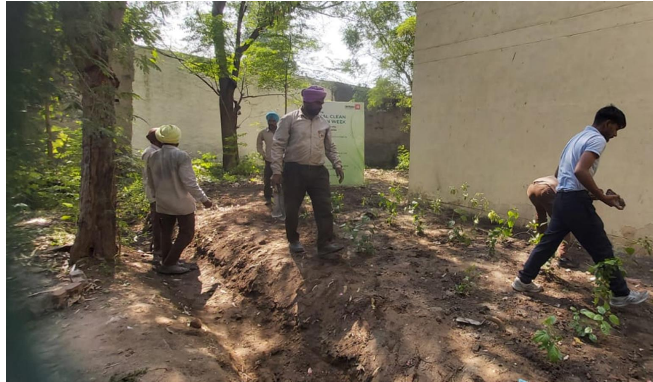
A drain was also created