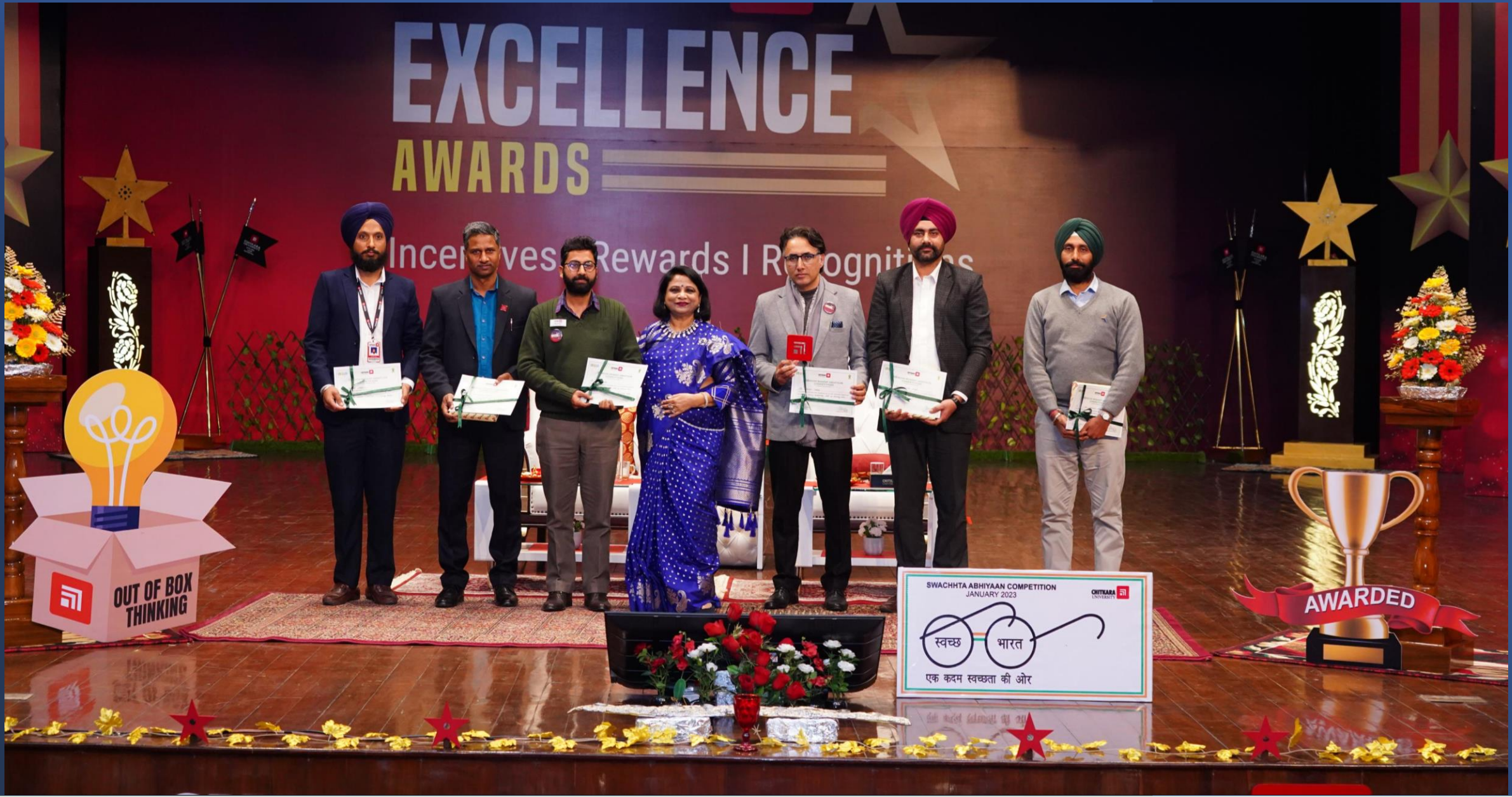
Third Position – R No. 114, Fleming Block – awards winners with Honorable Pro Chancellor and Respected VC