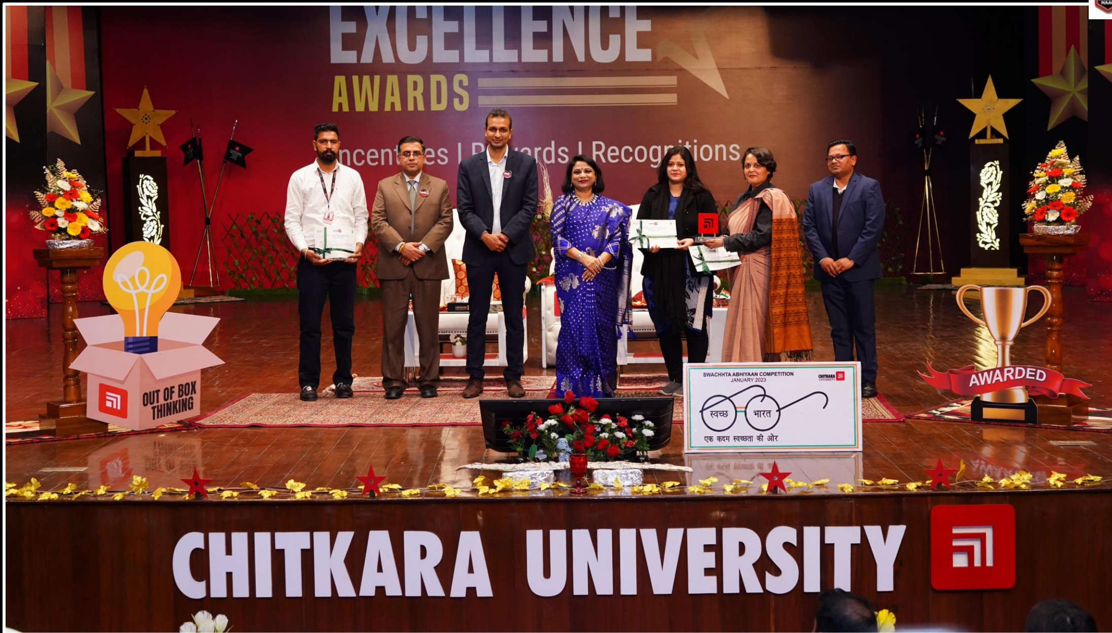
Second Position – R No. 509, Picasso Block – awards winners with Honorable Pro Chancellor and Respected VC