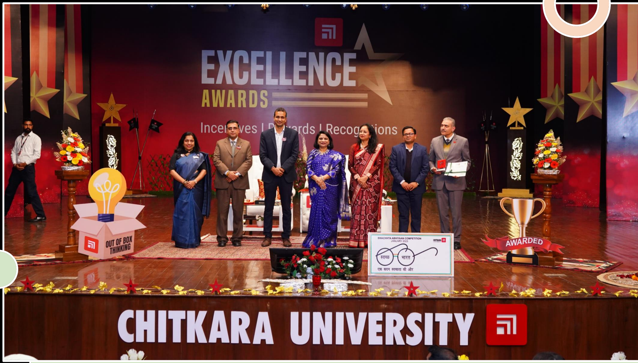
Third Position – LH 11, Escoffier Block – awards winners with Honorable Pro Chancellor and Respected VC