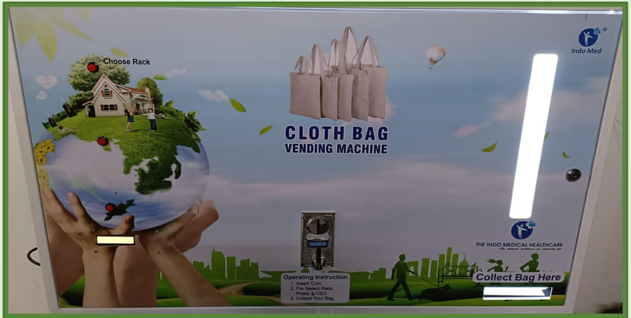
It's placed in the Visitor's Lounge at the Main Gate