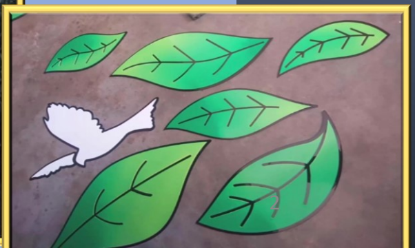
The creation and execution of the mural.....by Team - Office of Architecture & Design