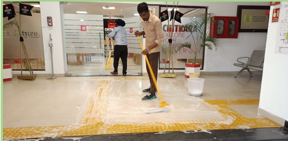
Various cleaning and shifting activities happened behind the scenes .... Team Administration at work