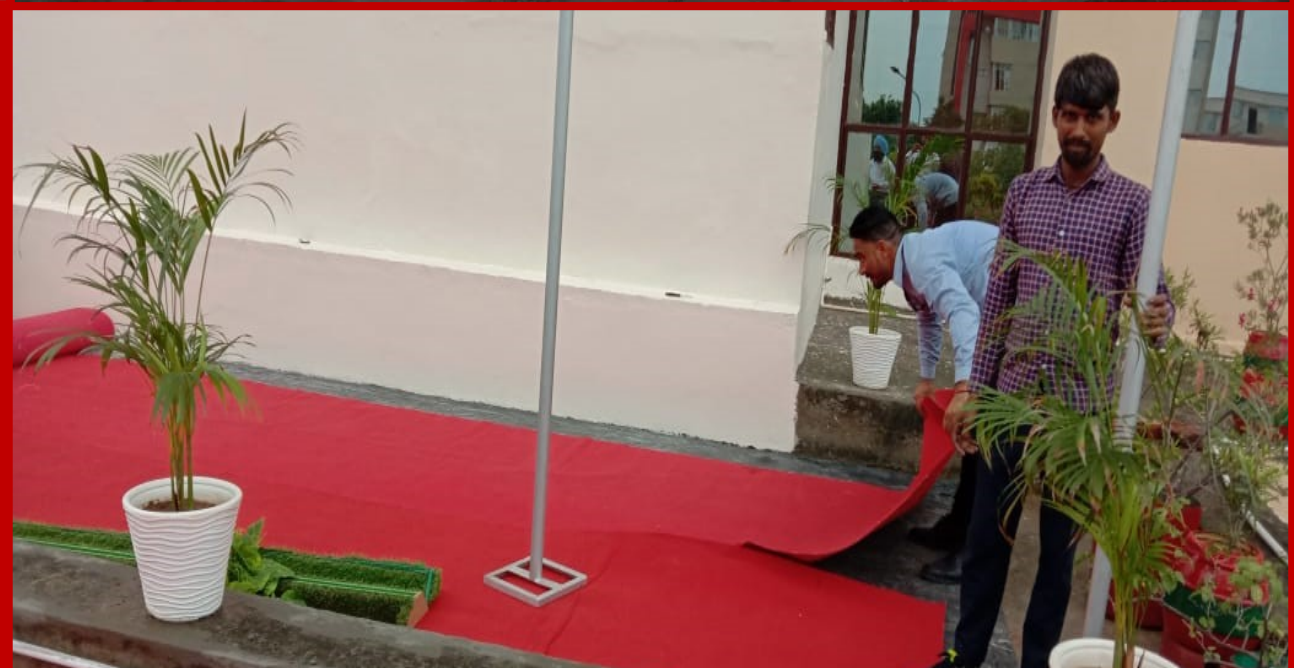
The floor was then covered with plastic sheets and then the carpets laid to keep the carpets dry