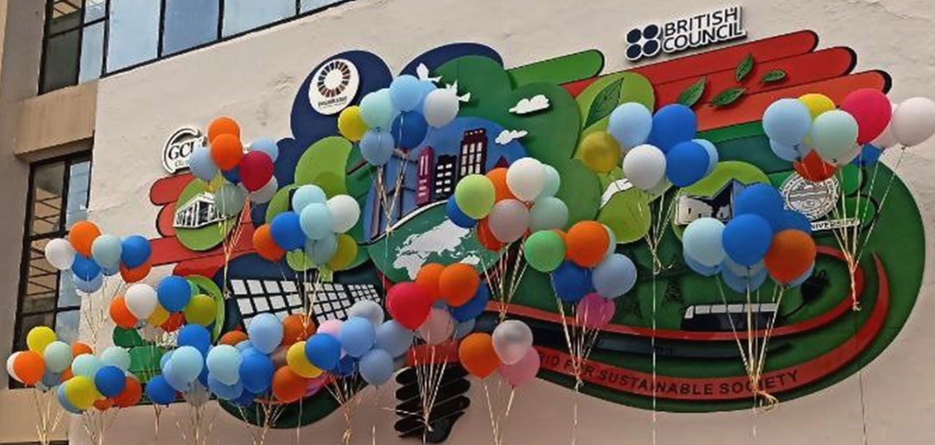
The mural with the "Balloons-curtain" !!