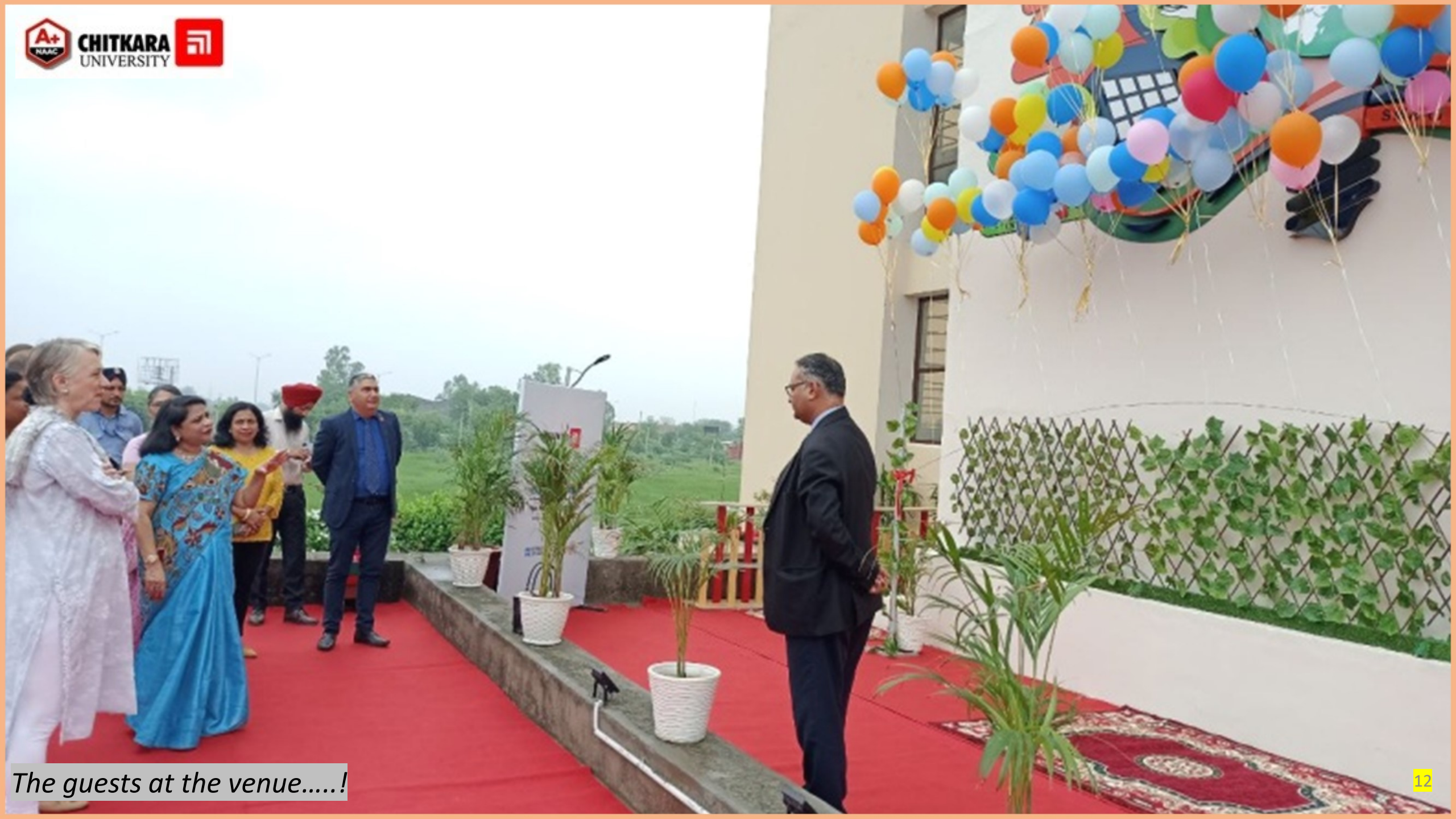
The guests at the venue.....!