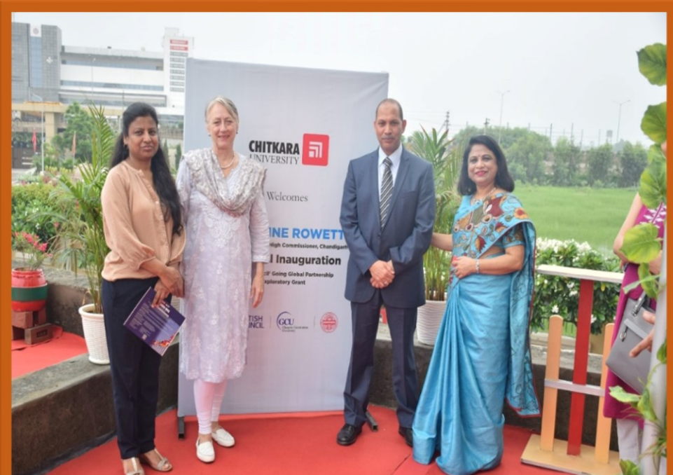
The guests with Hon'ble Pro Chancellor, Team OIA, Team Administration and Team OAD ...pose for the camera.....