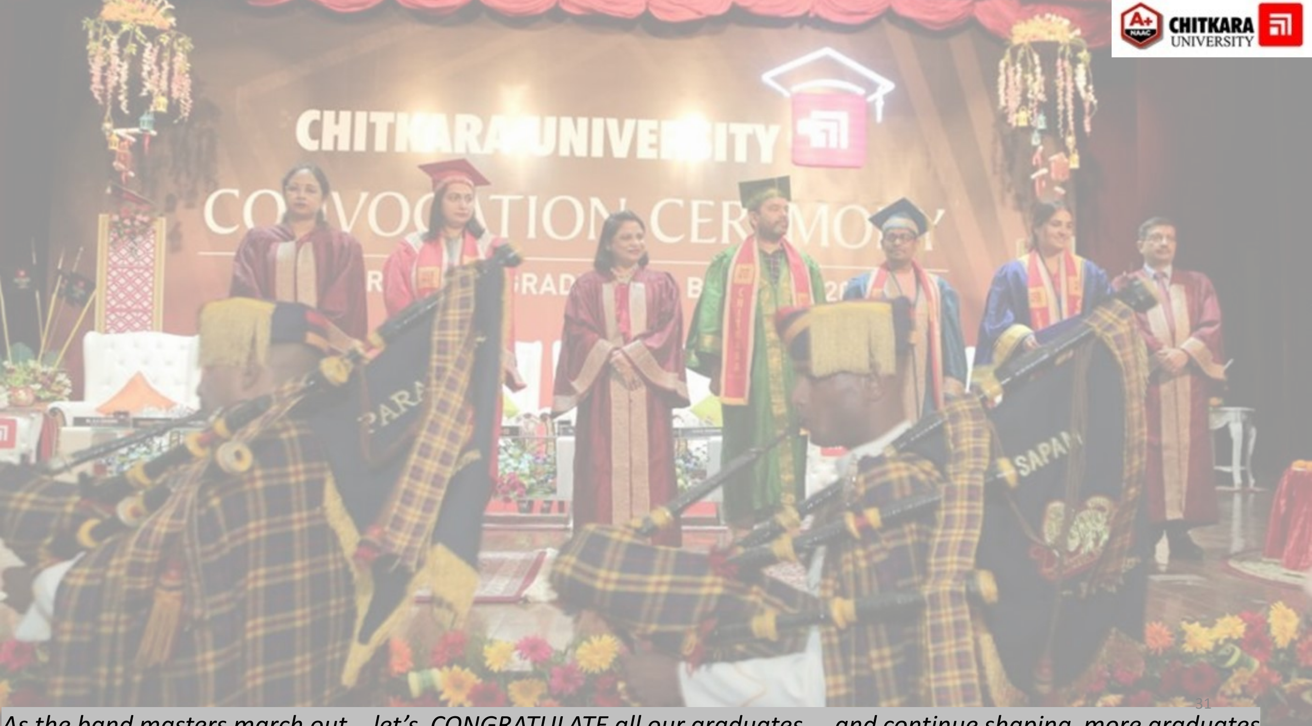
As the band masters march out....let's CONGRATULATE all our graduates ....and continue shaping more graduates