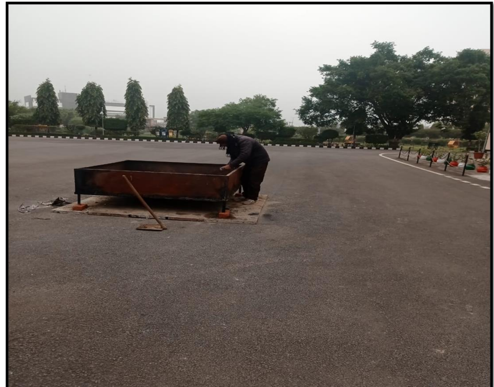
Cleaning of ash in the morning