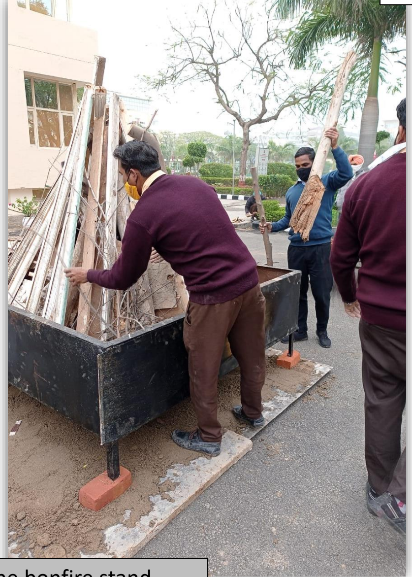
Placing wood in the bonfire stand