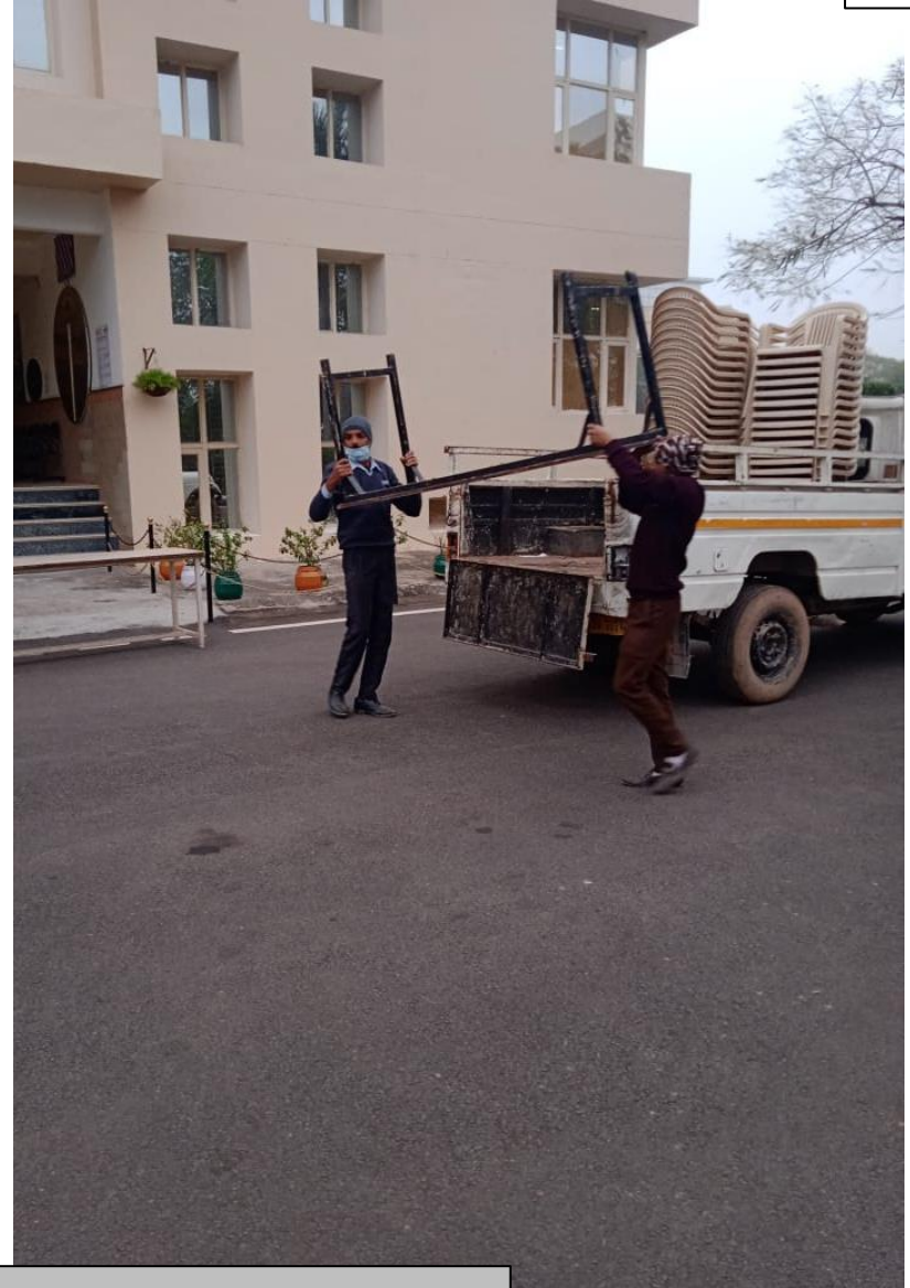
Providing furniture as per request of OSA