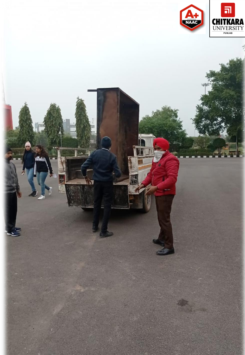
Bonfire stand being sent back to the admin store