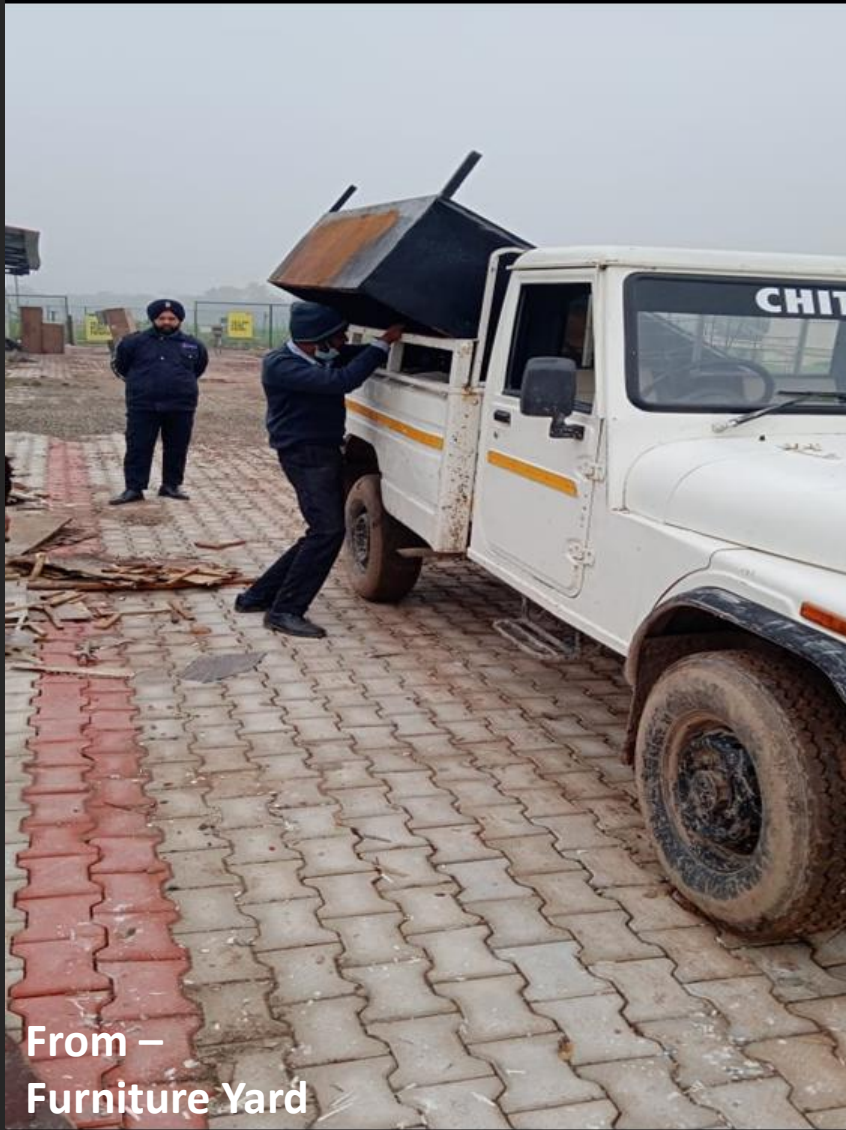
From – Furniture Yard