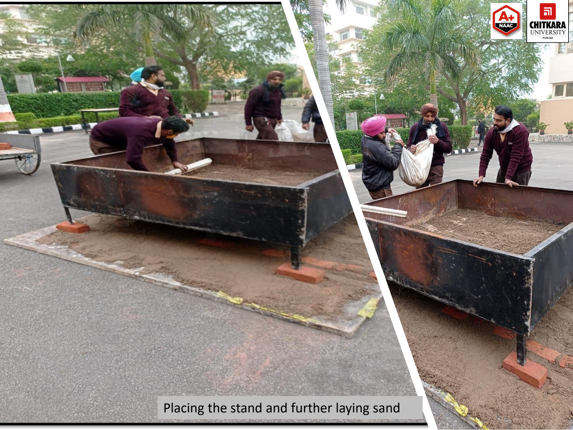
Placing the stand and further laying sand