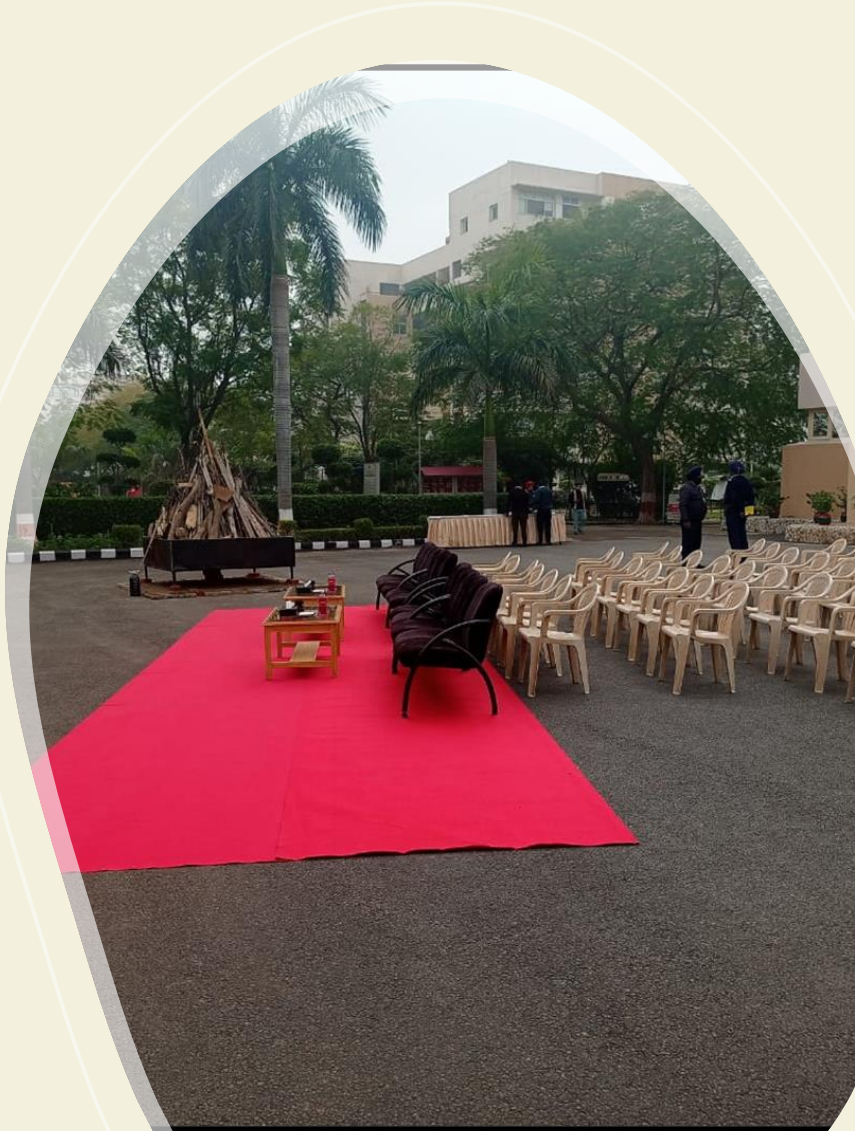
Venue set for Lohri Celebrations