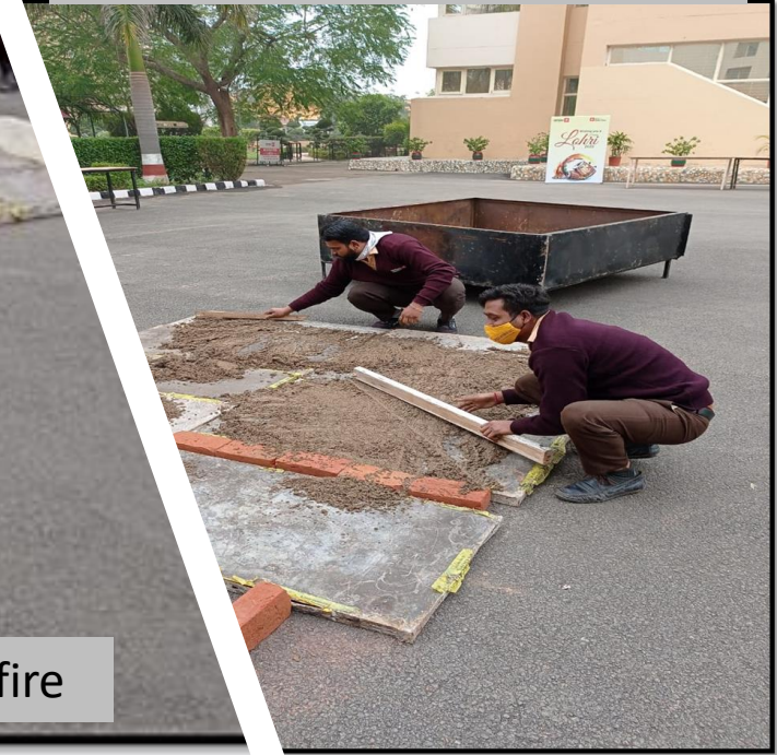
Shifting and laying shuttering plates and wood for the fire