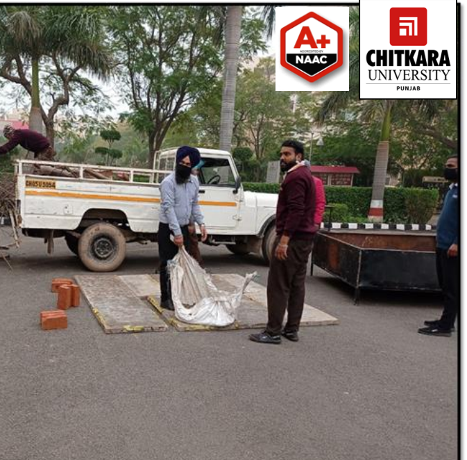
Sand on the shuttering plates