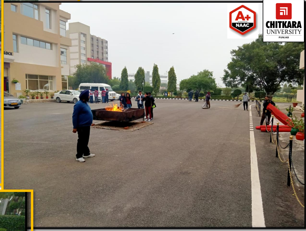
Cleaning after Lohri celebration