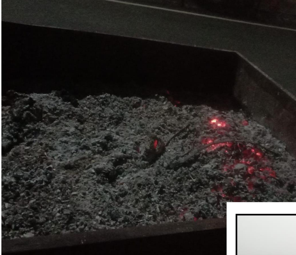
Bonfire status at night