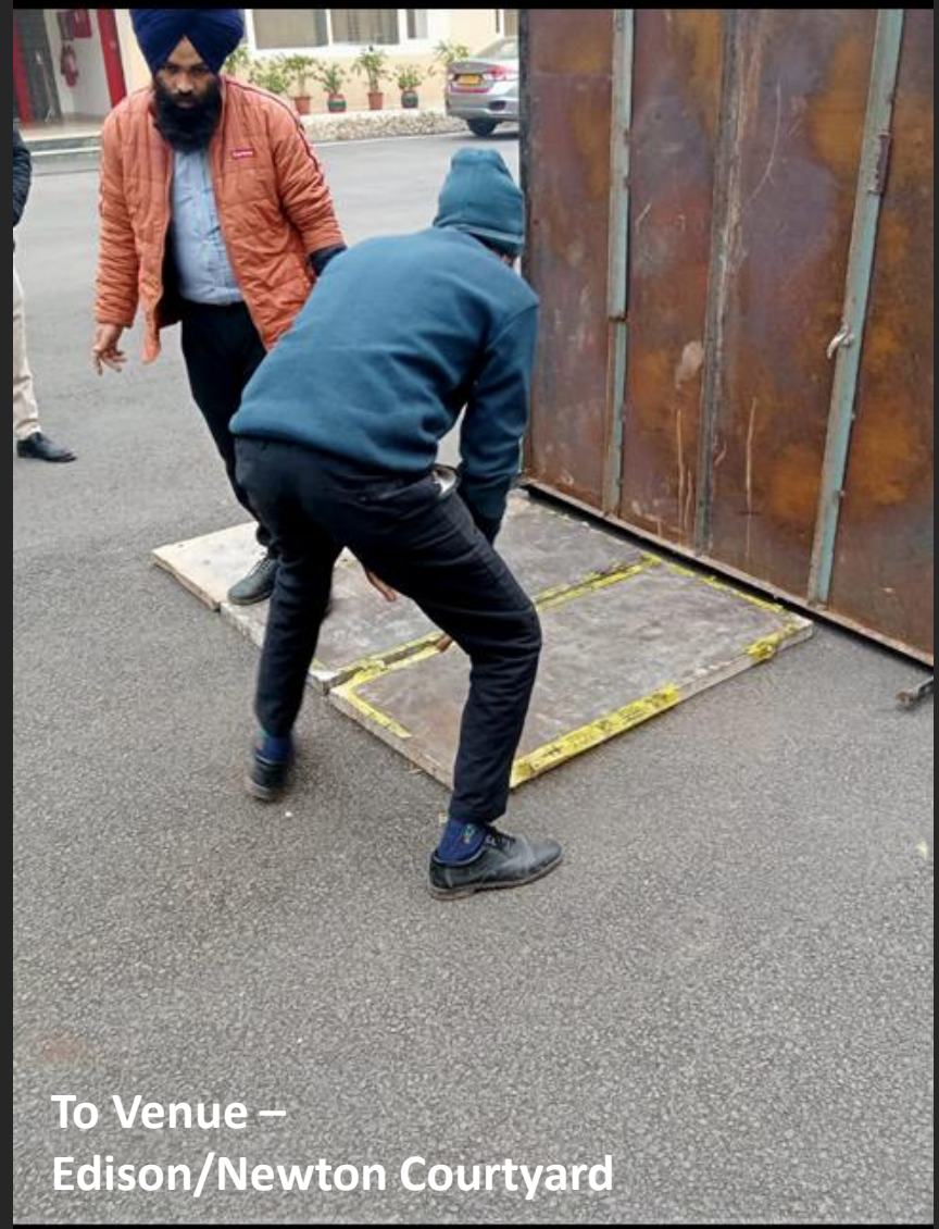
To Venue – Edison/Newton Courtyard