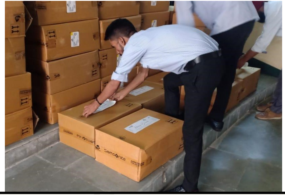
Diwali Wishes Stickers being pasted on each gift...