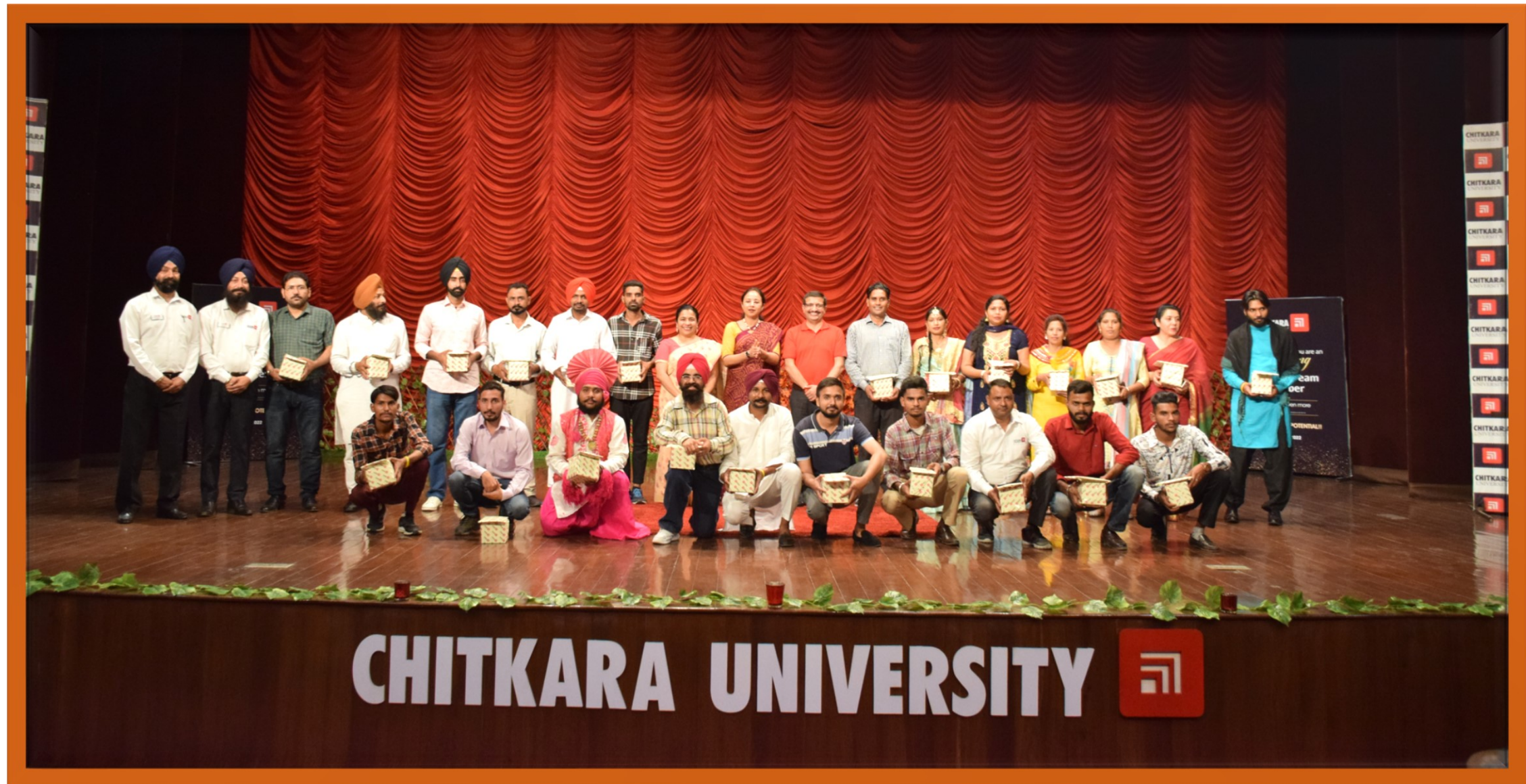
The performers with the Chief Guests and the organisers